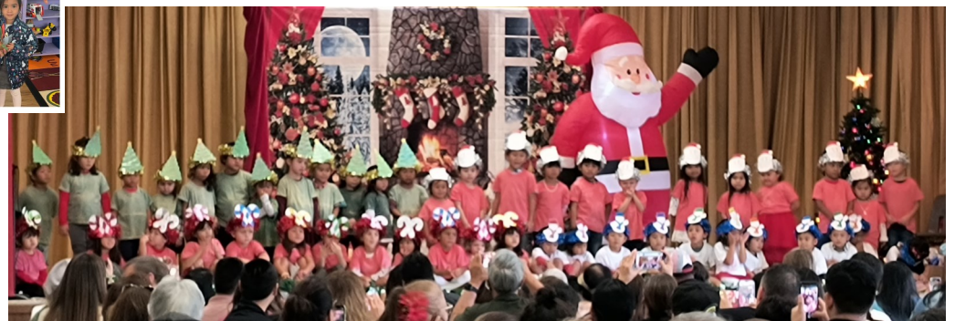
Our Christmas Program!