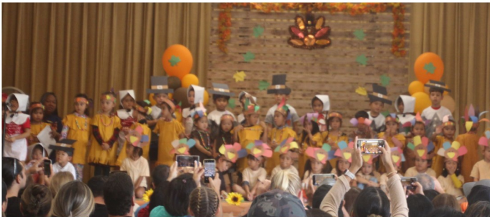
Our Thanksgiving Program!

We hope everyone enjoyed the holidays! The children were very busy with Christmas activities and learning songs for our program and playing with each other. They were very excited when Santa came to see them!! Acknowledgements were received from The Lahaina Hongwanji Mission as well as The Maui Humane Society for our donations ..so thank you for your help. Happy New Year to all of you.