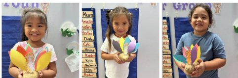
Thanksgiving Potato Turkeys