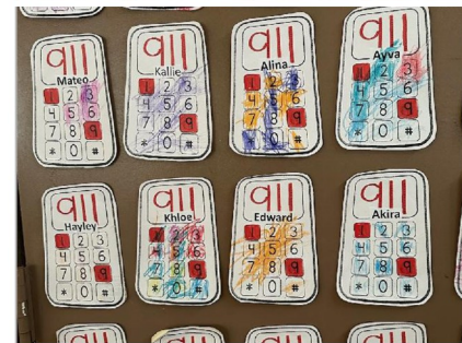
Learning about Fire Safety