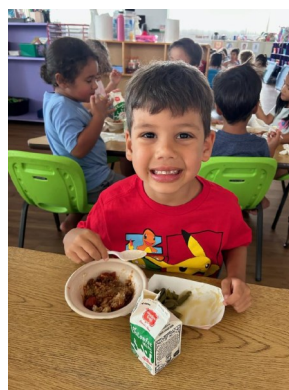
Two favorites! Eating and Napping!