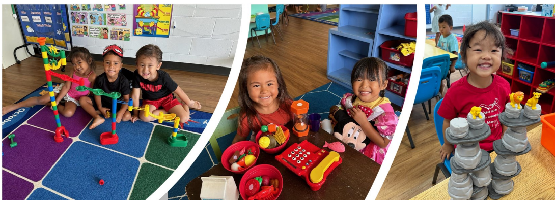
Making New Friends and Playing!