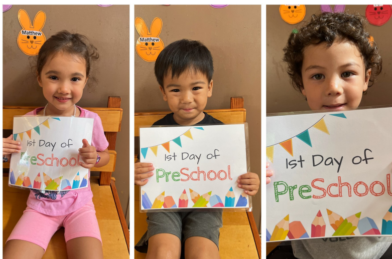
Hurray for our 1st Day!

We will be doing a Penny drive fundraiser to help the Lahaina Hongwanji and the Maui Humane Society . We will be collecting from now until September 15.