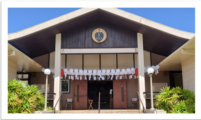
Nearly 100 lanterns honoring ancestors in front of the temple for Obon