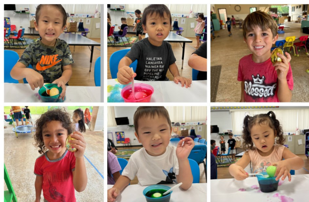
Dyeing our Easter eggs!