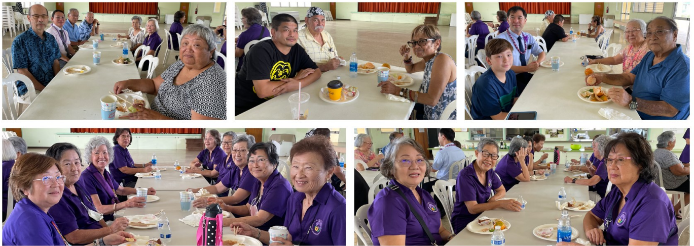
Eshinni-Kakushinni Day photos