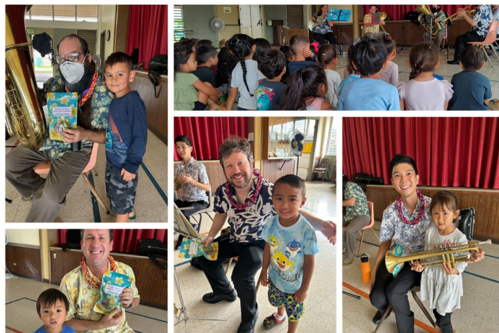
Honolulu Brass Quintet visit.