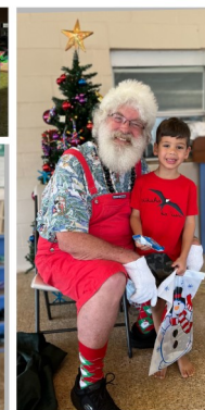
Santa came to visit us!