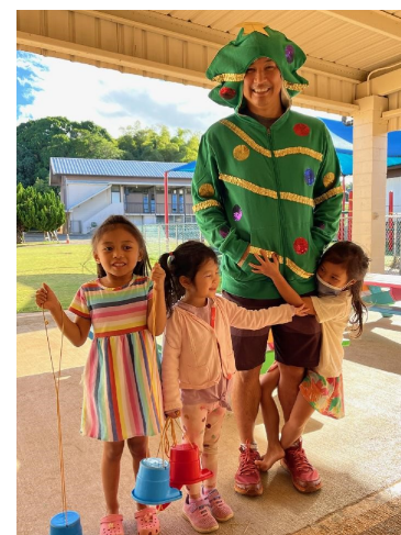
We had a visit from a Christmas tree!