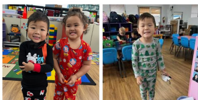
Pajama Day at school was cool.